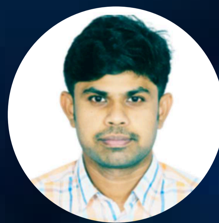
Asst. Professor-Grade 1

Assistant Professor National Institute of Food Technology, Entrepreneurship and Management, Thanjavur (NIFTEM-T)